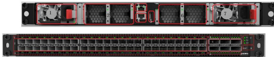
Figure 1. GPON OLT IO Blade.

The first step is to create an I/O blade with the PON OLT MAC. AT&T is working with the Open Compute Project to develop an open specification for a GPON MAC 1RU “pizza box”, as shown in Figure 1. This blade includes the essential GPON Media Access Control (MAC) chip under control of a remote control program, which is, in turn, controlled from high level applications via OpenFlow. This replaces an existing closed and proprietary OLT chassis (not shown) that integrates this GPON MAC chip with GPON protocol management, 802.1ad-compliant VLAN bridging, and Ethernet MAC functions. These other functions from the legacy device are being unbundled and implemented in software.