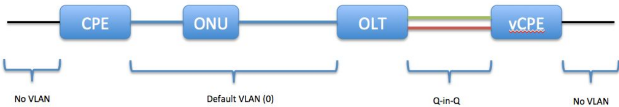
Figure 4. VLAN architecture of PON access

Figure 4 shows where VLAN tagging happens as traffic flows from a subscriber's home to the Internet. Within the home there are no VLAN tags. A default VLAN tag of VLAN ID 0 is added at the physical home CPE in order to carry Ethernet precedence bits. The OLT instructs the ONT to add/remove the appropriate C-Tag to the traffic inside the PON, and the OLT adds an S-Tag to the packet in order to uniquely identify the subscriber's traffic in the fabric. The inner tag (C-tag) identifies the specific subscriber within the OLT device they are attached to. The outer tag (S-tag) identifies the OLT device itself. Taken together, these two tags can identify a subscriber uniquely across all OLT devices in the system. The fabric maps the two VLAN tags to a pseudowire which forwards the traffic between the OLT and the vSG. The vSG strips the VLAN tags, performs its functions, and then forwards the packet along the service graph. VLAN tags are not needed after the vSG because the vSG also NATs the traffic to the vSG's WAN address, which is unique in the system.